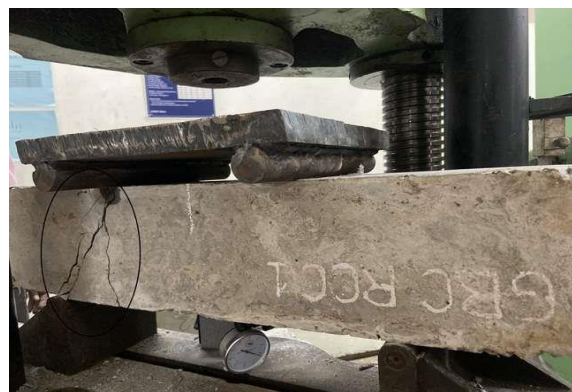
Fig. 10 Flexural Tension Failure in Grooved Bamboo Coating Reinforced Cement Concrete Beam