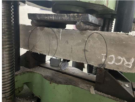
Fig. 8 Flexural Tension Failure in Reinforced Cement Concrete Beam

The crack pattern observed to be same in all beams with beams subjected to flexural tension failure and cracks originating on the tension side. The cracks propagated towards the compression side, finally reaching the boundary of the beam. Beams across all the categories exhibited similar behavior with cracking of concrete initiating at the tension side of the beam and radiating towards the compression side of the beam. After the cracks had extended deep into the compression zone, the collapse of the beams was observed