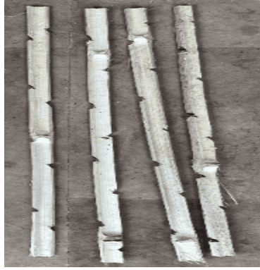
Fig 1 Prepared Grooved Bamboo Reinforcements