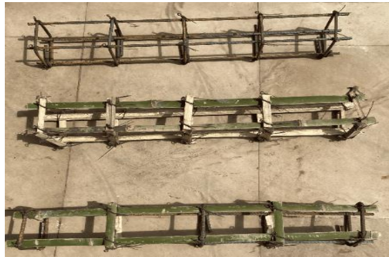
Fig 2 Prepared Bamboo & Steel Reinforcement