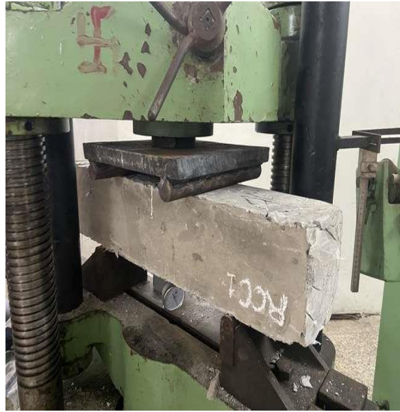
Fig. 6 Beam Testing Setup