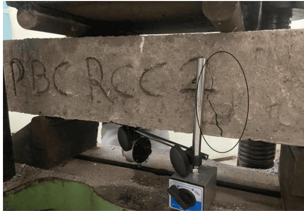
Fig. 10 Flexural Tension Failure in Bamboo Coating Reinforced Cement Concrete Beam