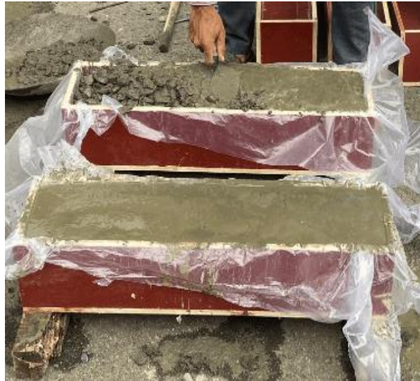
Fig 4 Casting of Beam Panels