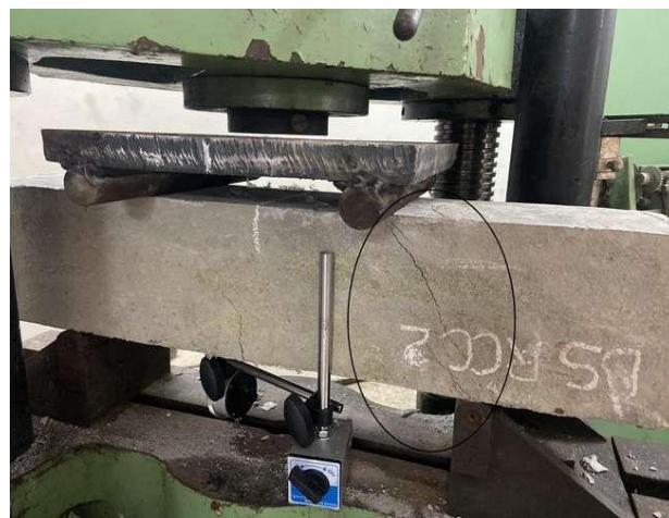
Fig. 11 Flexural Tension Failure in Bamboo Steel Reinforced Cement Concrete