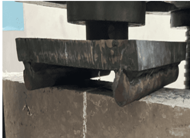
Fig. 7 Beam Subjected to Loading