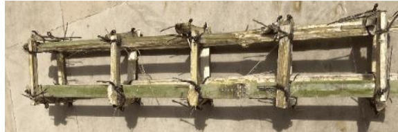
Fig 3 Prepared Coated Bamboo Reinforcement

b. Moulds: 6 Plywood Moulds of size 700 mm x 150 mm x 150 mm are fabricated for casting of 15 beams. These moulds are provided with holes on either side to conveniently lift the beams, when required to be cured. The moulds are then to be coated with grease or oil before casting in order to easily remove the concrete from mould.