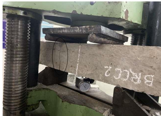
Fig. 9 Flexural Tension Failure in Bamboo Reinforced Cement Concrete Beam