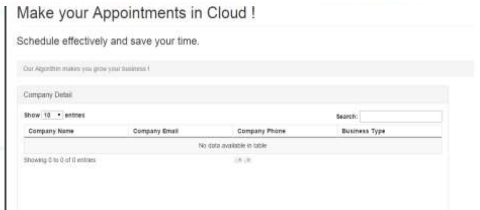
Fig 2: Screenshot of Details about the company profile