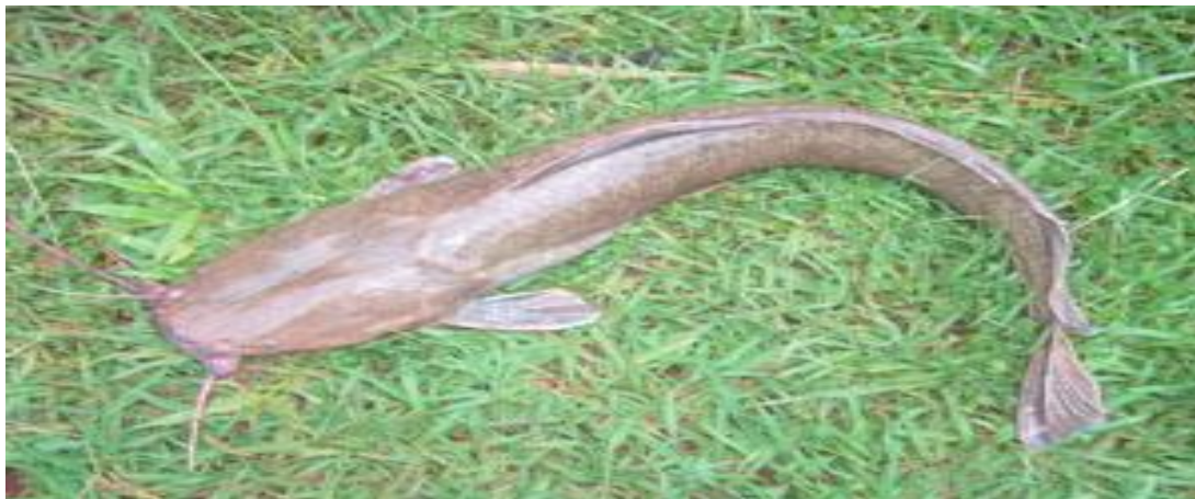
Figure 1: Image of Clarias gariepinus

A total of 145 freshwater Clarias gariepinus ranged from 200-250 g body weight were collected alive from River Usuma and transported immediately to the lab in large plastic bags partially filled with water and containing air according to (Vickery and Poulin, 1998). The fish were examined for gross clinical signs and pathological lesion. The necropsy technique of parasitological examination of skin, fins and gills was carried out for the presence of external parasites with recording the average and intensity of the isolated parasites from 145 catfish, the other 45 catfish were kept for applying the treatment. The recovered protozoa and monogenea were fixed, preserved and stained according to Ottesen (2007), Vickery and Poulin (1998).