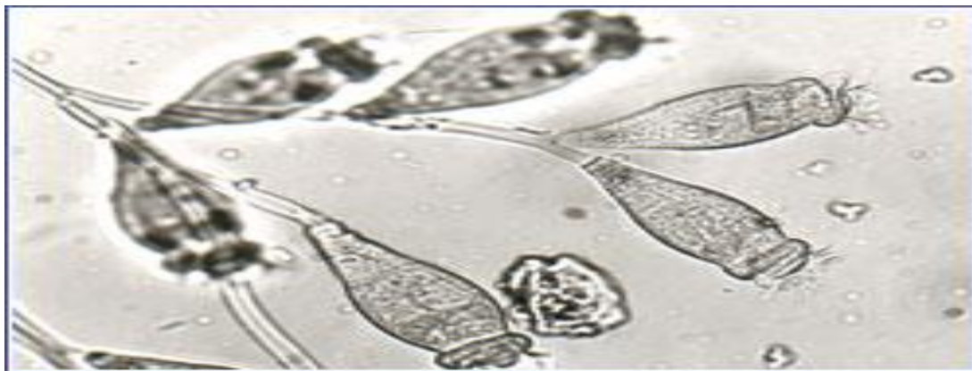
Figure 3: Image of Epistylis spp