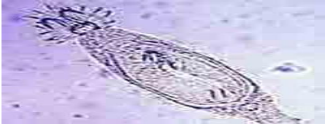
Figure 2: Image of Trichodina spp