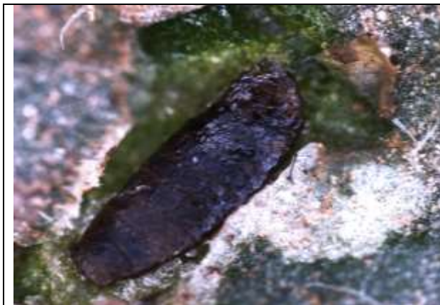
Fig. 3. Dead larvae of L. trifolii