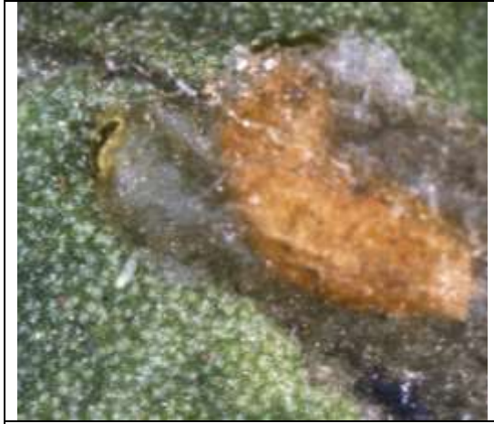
Fig. 1. Active larvae of leaf miner on tomato