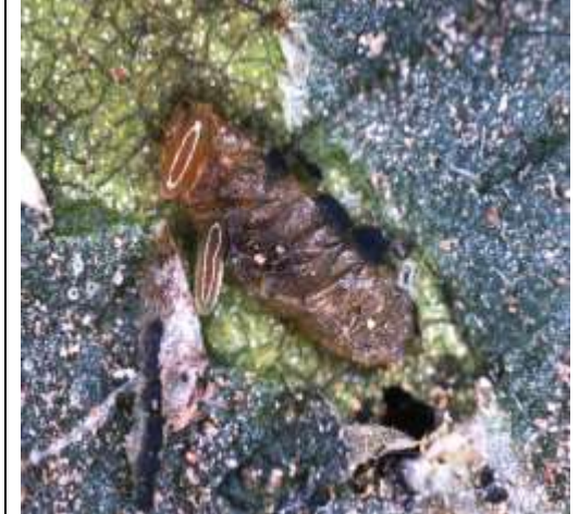
Fig. 4. Parasitization of leaf miner larvae by Diglyphus isaea