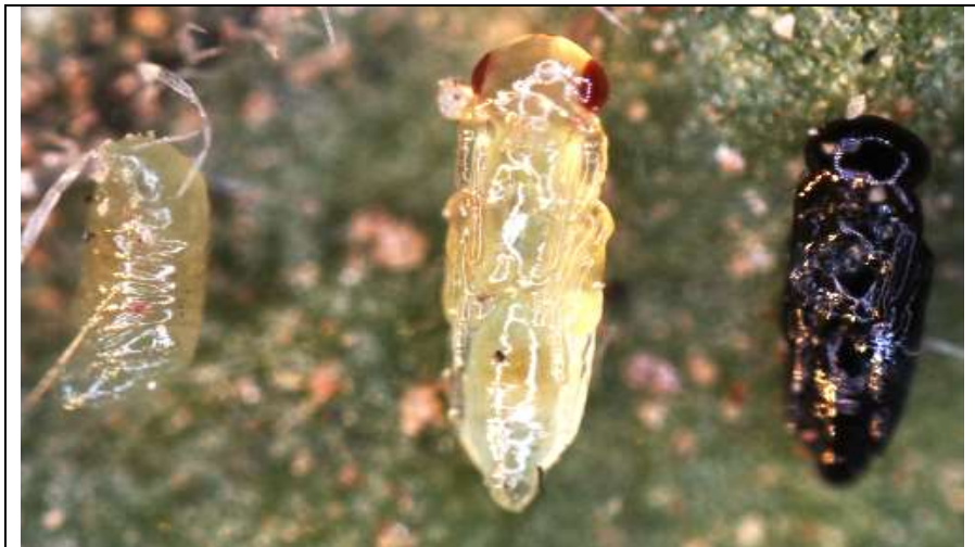
Fig. 5. Larval, Prepupal and Pupal Stages of D. isaea