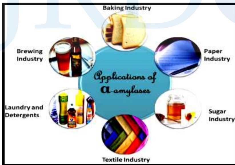
Fig. 1: Applications of \alpha - amylases in different industries (Guzman-Maldonado and Paredes-Lopez, 1995)

\alpha -amylases can be used at industrial level in sugar, textile, baking, paper, and brewing industries as shown in Fig 1.