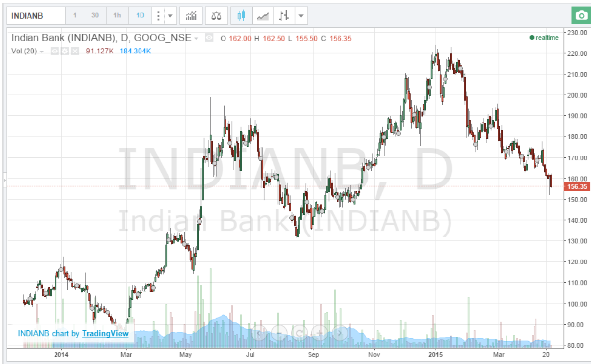
Figure3: Stock status using Technical indicator