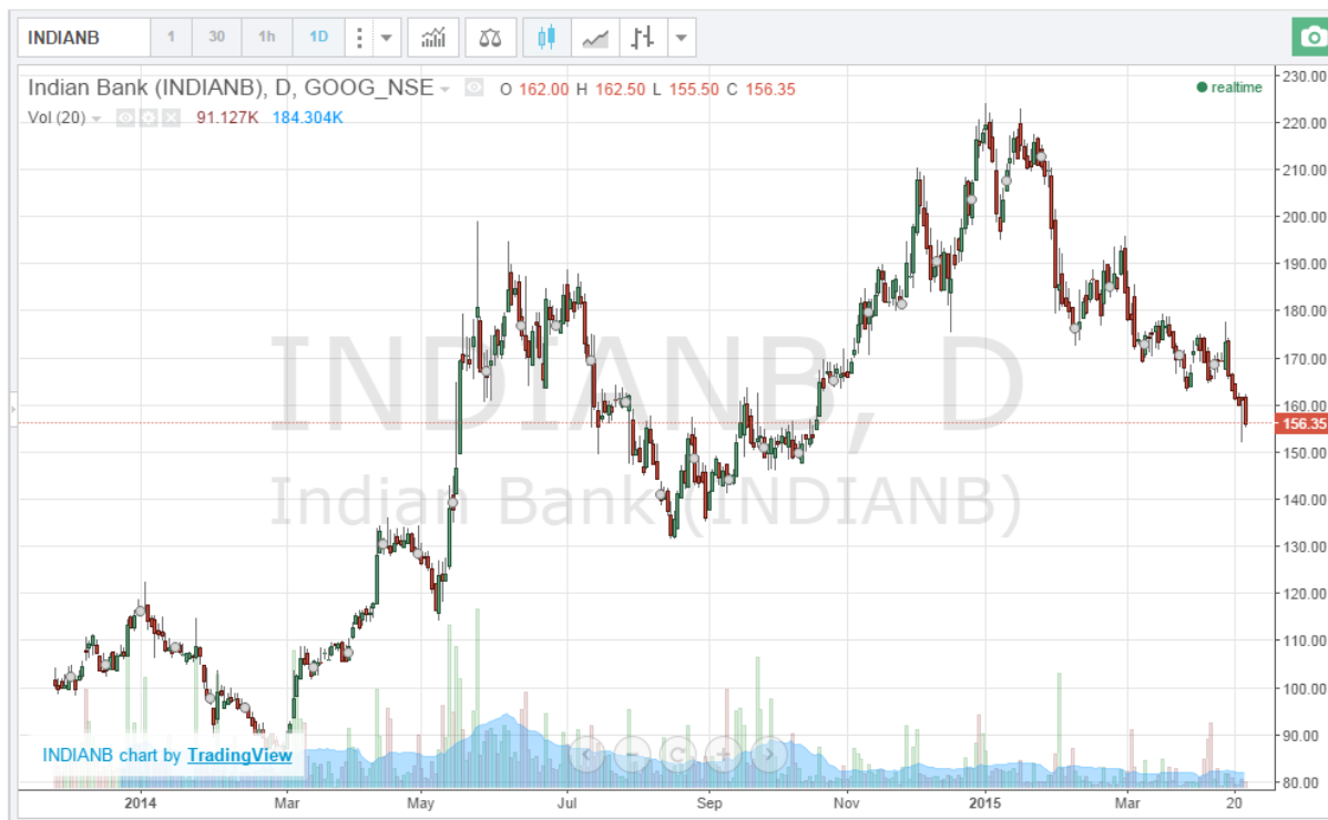
Figure3: Stock status using Technical indicator